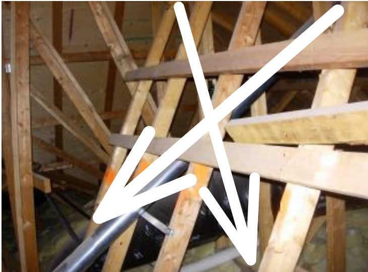
"X" brace all lateral bracing