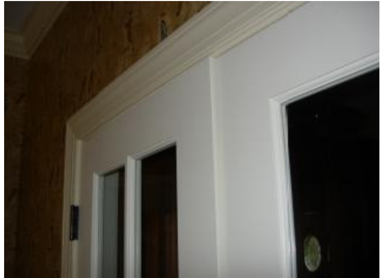
Warped door in home office