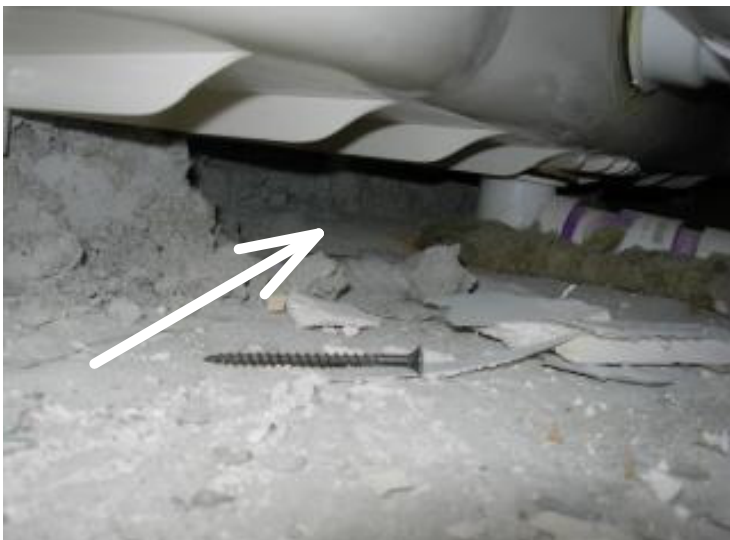
Note the missing cement under the tub