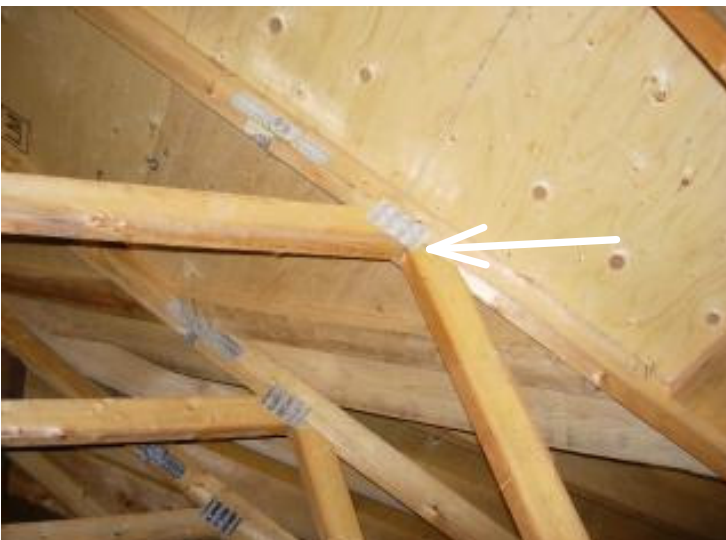
Gusset plate on truss barely securing the lower web