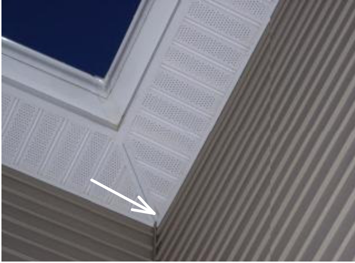
Short soffit noted in rear of home