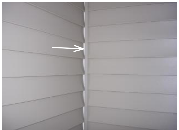
Several areas of the home have this condition