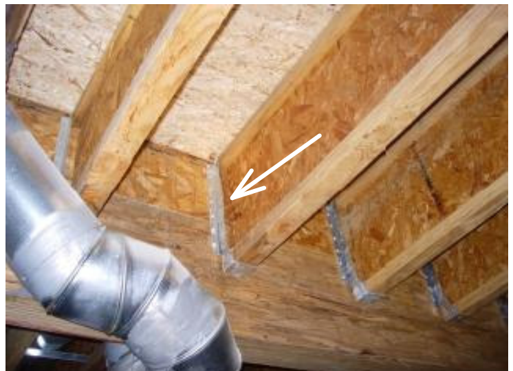
Install fillets on all I-beams with hangers as per manufacturer's recommendations