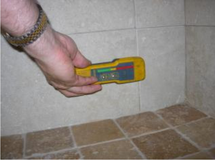
Area of shower and master bath that is wet behind the tile