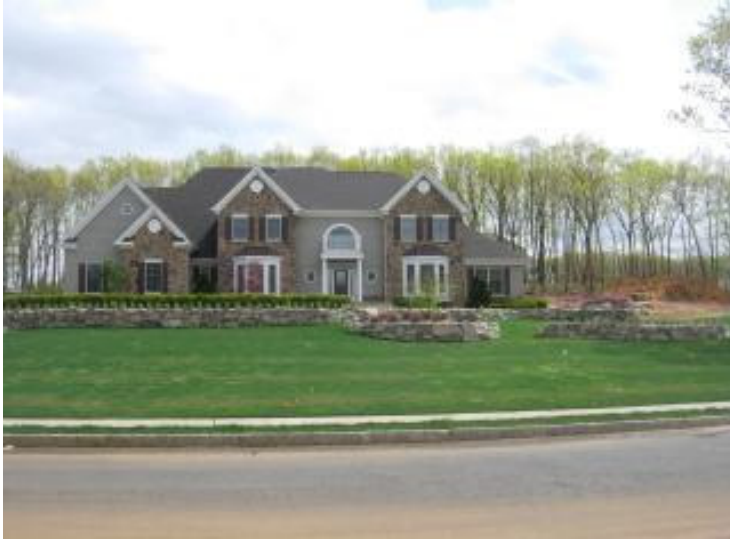
Front View of the Home