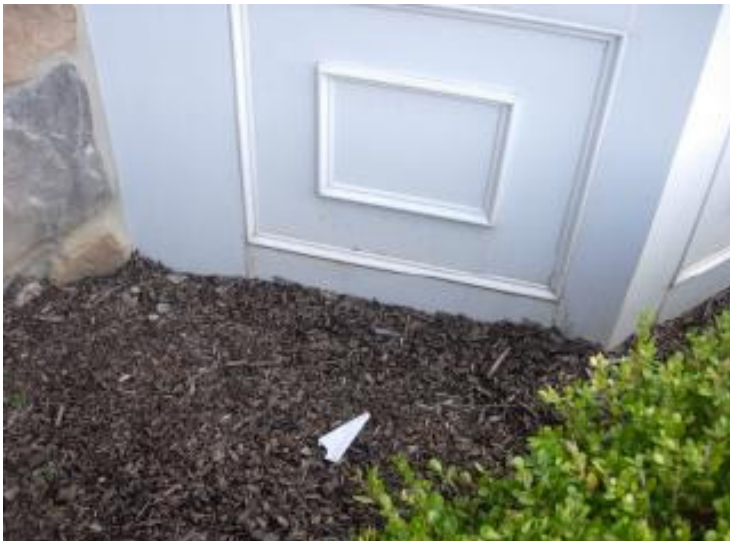
Mulch to close to framing/home