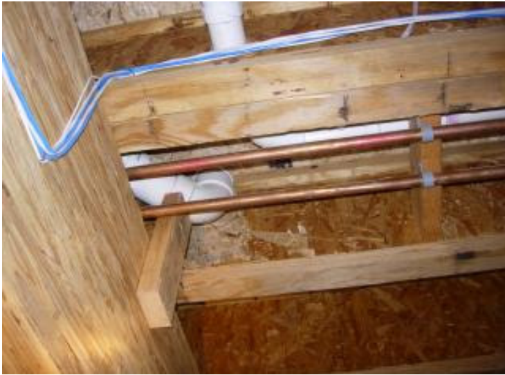
Double/replace this damaged I-beam