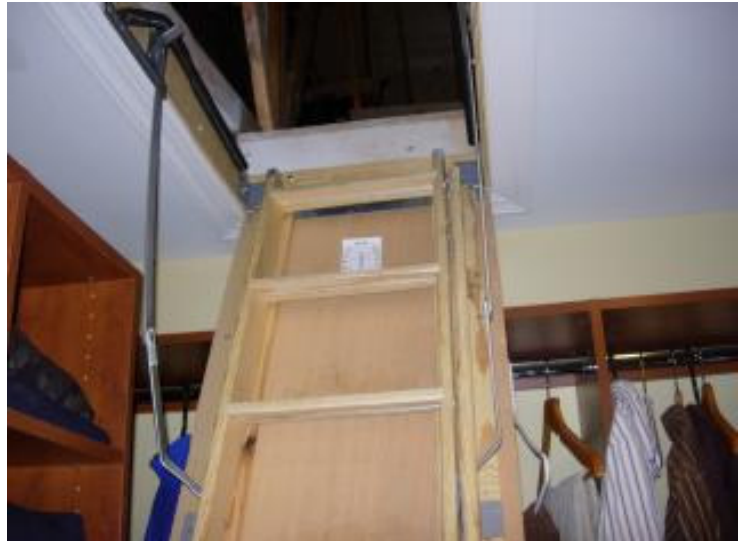
Install insulation box over the pull down stairs