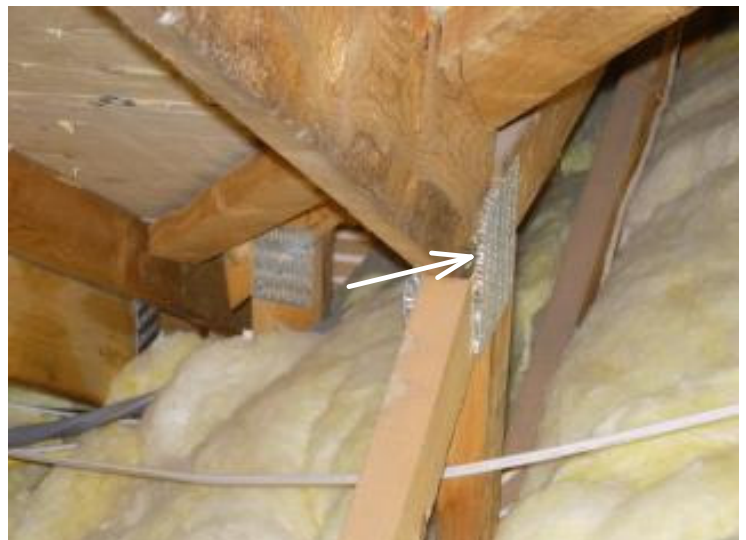
Loose gusset plate