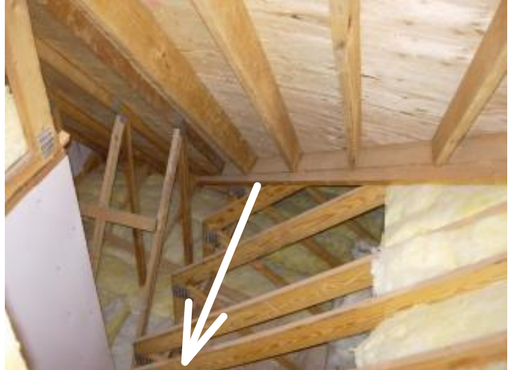
Install lateral bracing across these trusses at the wall line