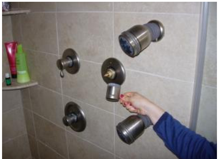
Loose handle in master bath shower