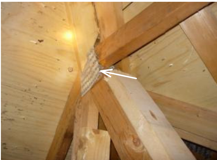
Loose and twisted gusset plate