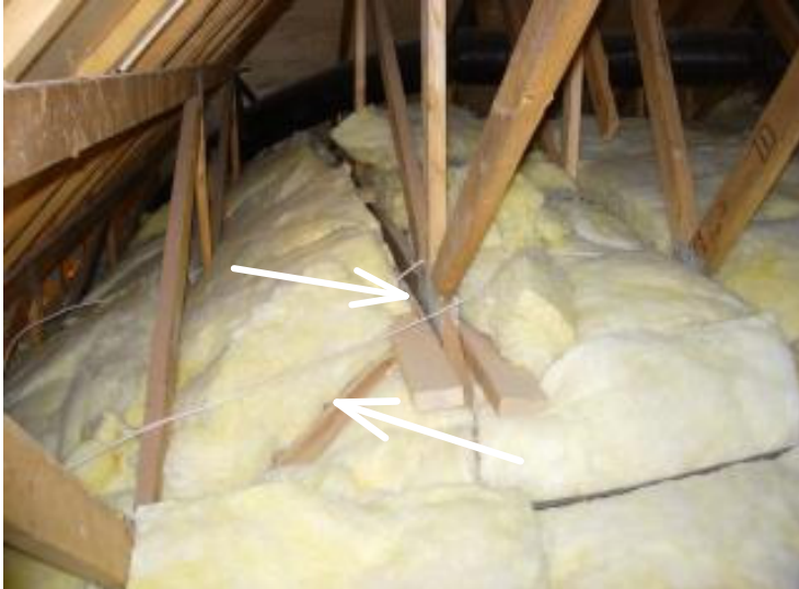
Missing/poorly installed insulation at coffer ceilings