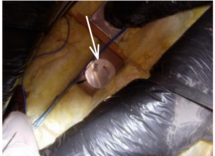
Install insulation over all recessed lights