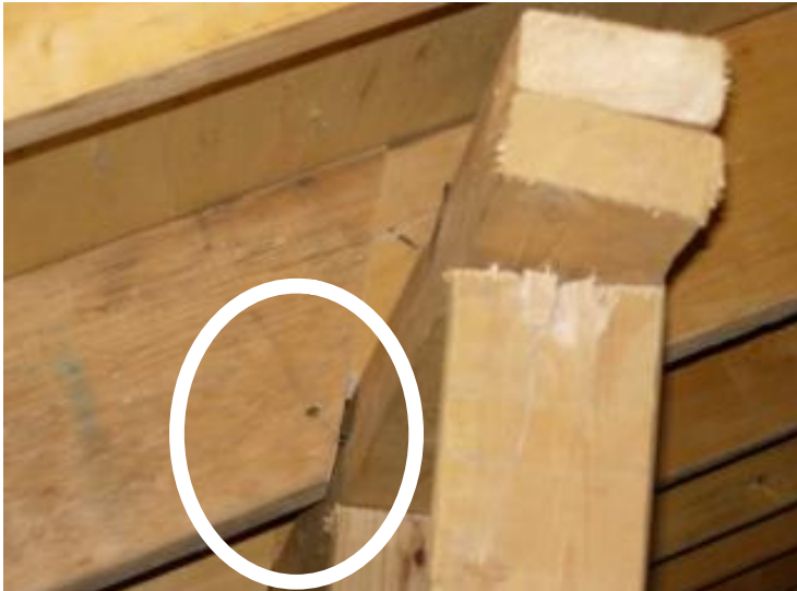
Install 2x4 under the rafters for support