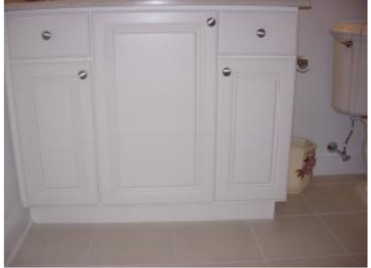
Align all doors and drawers on cabinets with full overlay doors